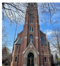
St. Nicholas Church / Iglesia de San Nicolás