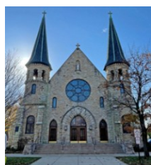
St. Mary Church / Iglesia de Santa Maria